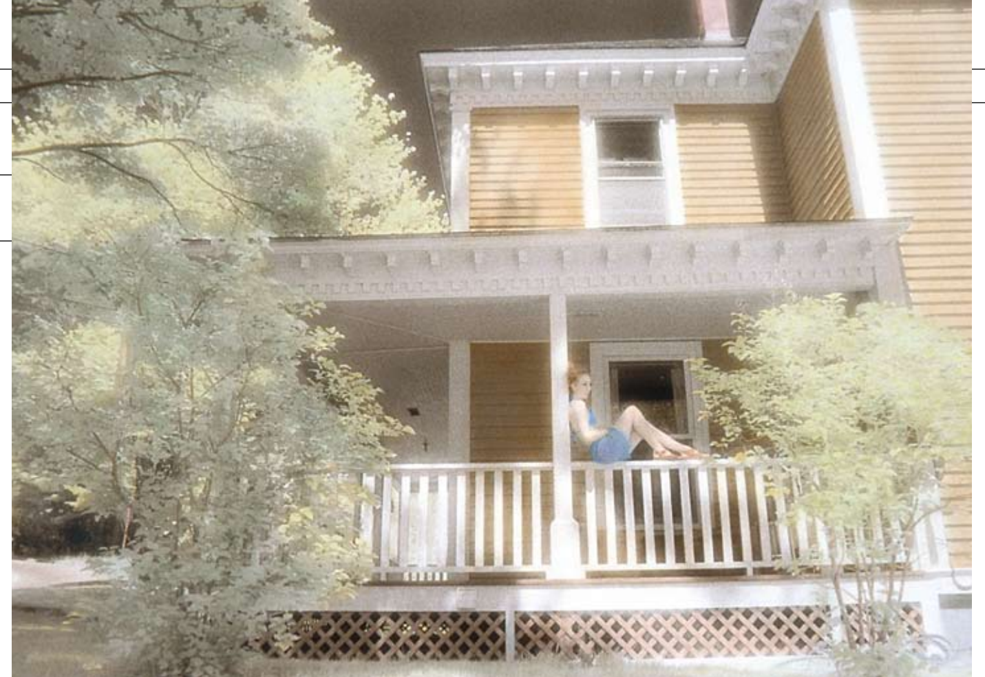
Verandah (12"x18" black and white infrared print, sepia-toned then coloured by hand with oils and pencils)