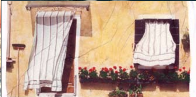
Burano (3 1/4" x 4 1/4" Polaroid emulsion transfer print, slide copied on to Polaroid film, emulsion transferred to watercolour paper, some coloured pencil added)

"New Thought" mantras being "You get what you think about".