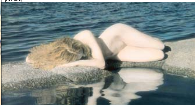
Renaissance (12"x18" black and white infrared print, coloured by hand with oils and pencils)