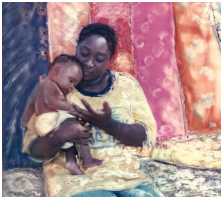
Mayreau Baby (digital reproduction of a 3"x3" SX-70 Polaroid print which has been manipulated during development to add the wavy texture)